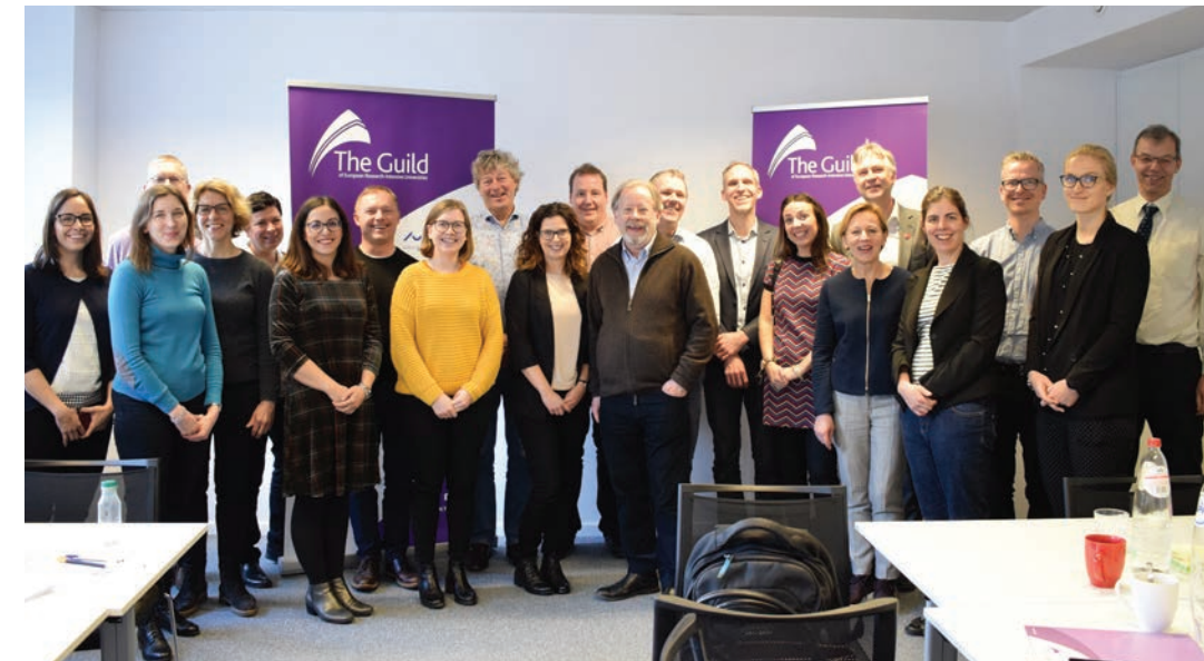
Research Support Offices working group, 2019.